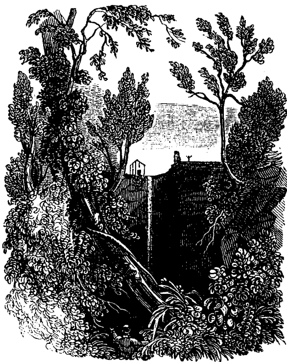
DEVIL'S HOLE FROM BELOW.

dark waters down this fearful chasm, and over the vast rocks that form its bed, to the river below.