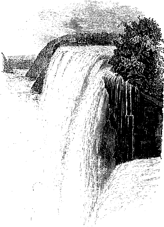
THE THREE PROFILES.

and are situated as shown in the engraving above. The first, or upper one represents a negro; the